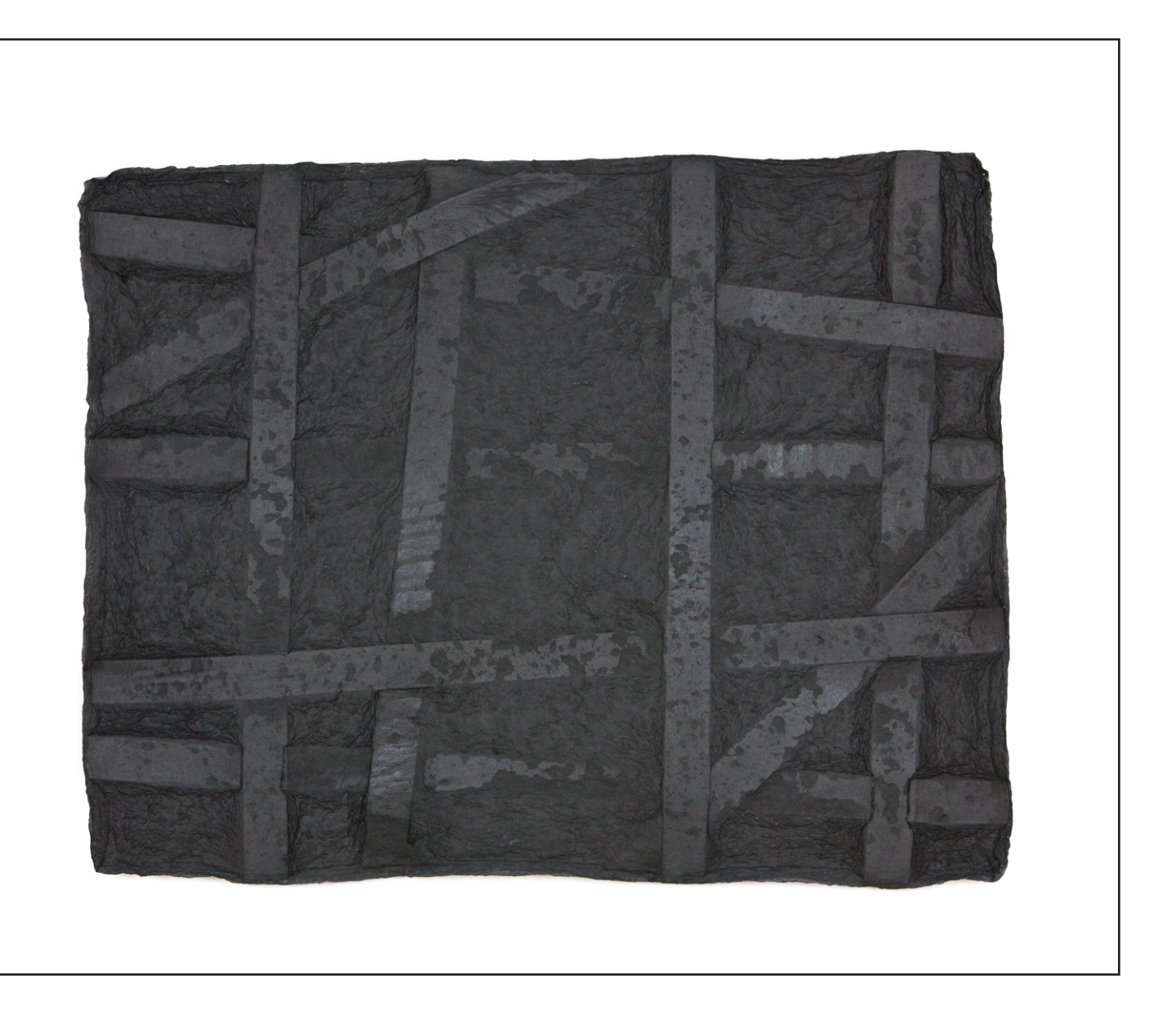
Lines_13092021 Fibres hold with ratchet tie-down strap, 57 x 43 cm,