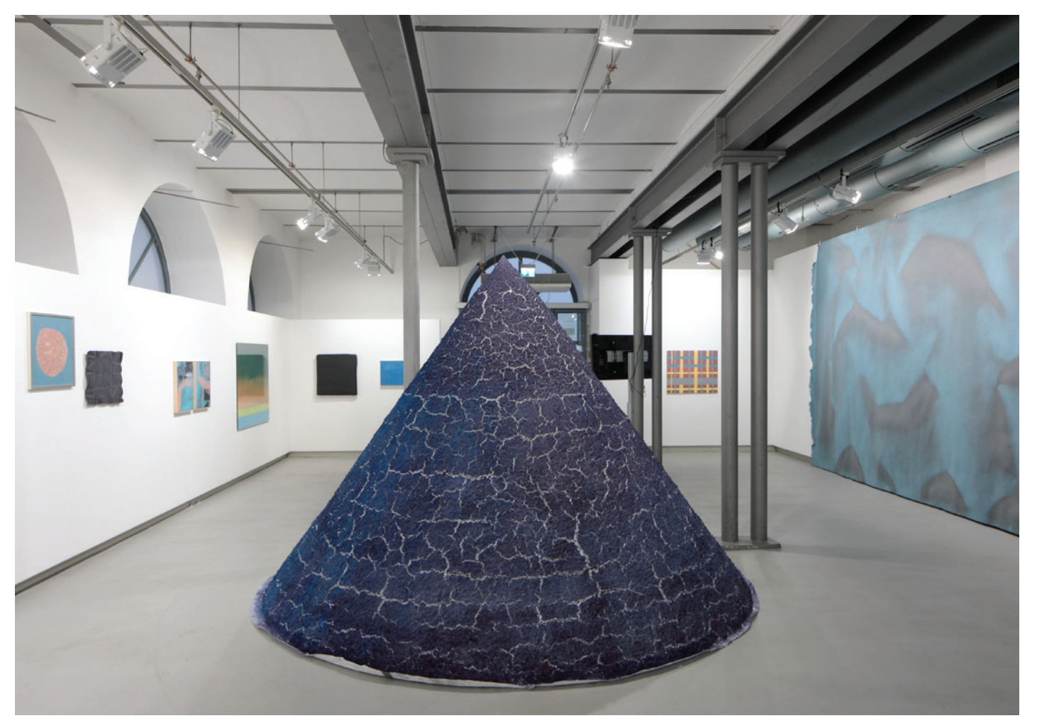
Cone_KVD drying Fibres, Pigment, ø 350cm, 2021